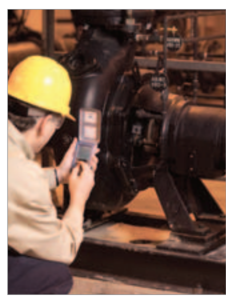
Chesterton engineers collect performance data on critical equipment, key to developing value driven reliability programs.