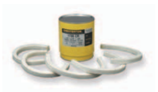
1730 Cut Packing Rings reduce waste and simplifies installation.

Chesterton is the global leader in innovative, value driven sealing device products. Together, with our knowledgeable specialists and technical team, Chesterton offers reliable solutions for all your sealing device needs—solutions that exceed your specific operational, environmental, and service requirements.